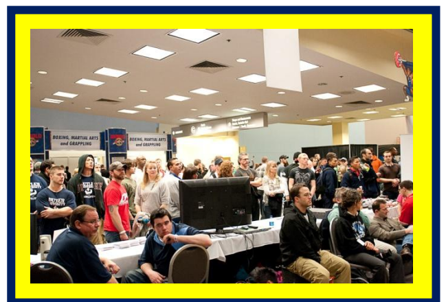
Crowds watching the warm up area.