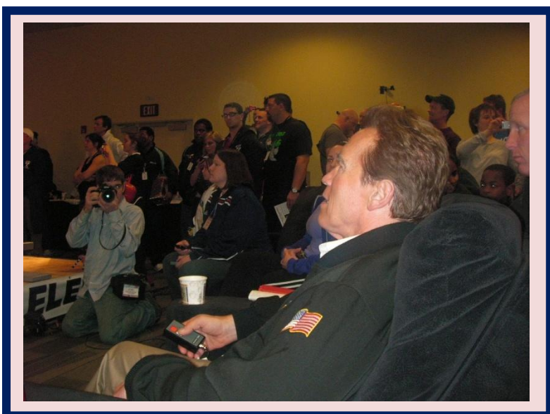
Arnold Schwarzenegger referees the competition for a short while.