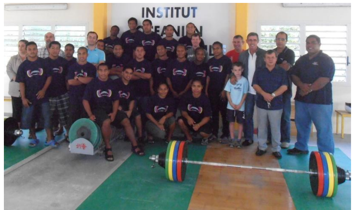
Group photo: institute lifters with New Caledonia officials.