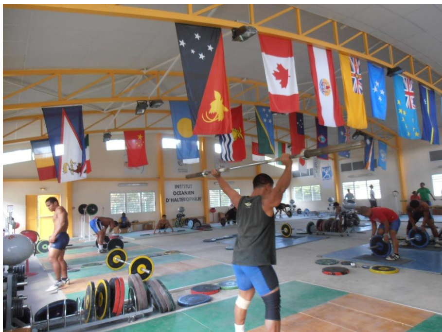
With the Games three weeks away, training is at full pace at the Institute.