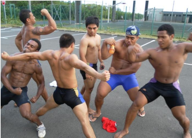
Some of the athletes having some fun in their spare time.