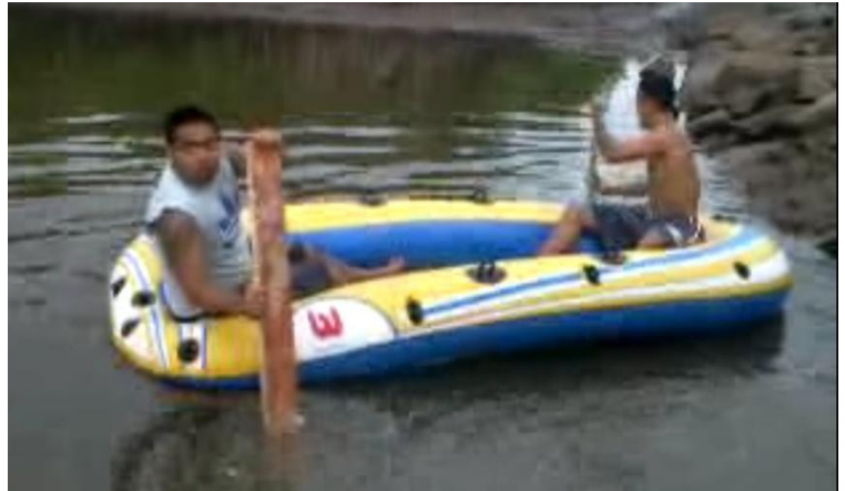
Sunday ..... during their rest day – trying a new sport in 30cm deep water