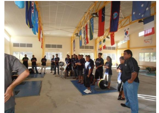
The Pacific institute athletes attending the function.

At these Games, 45 gold medals are at stake. The anticipation is that all gold medals will be won by institute lifters who are currently training in Noumea and former institute lifters who started or trained at the Institute in the past.