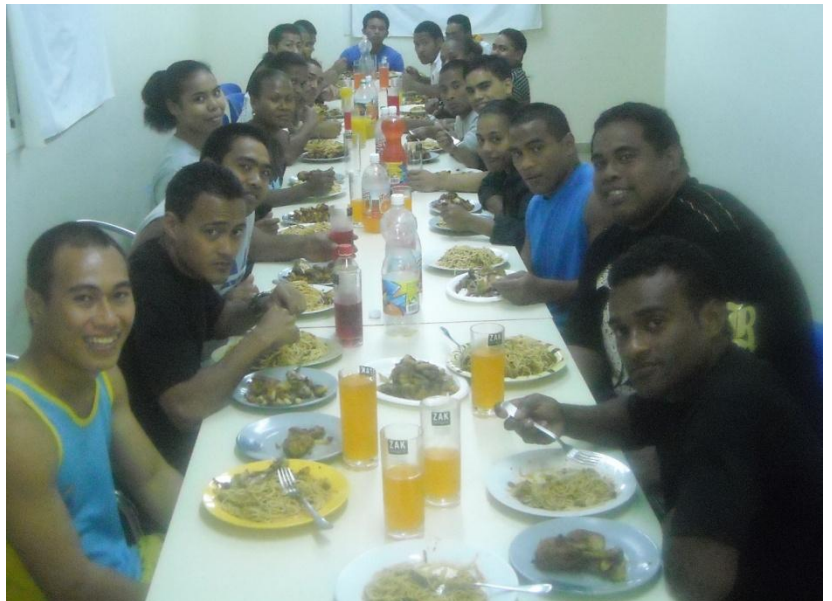
After a heavy training session, what you need is a good dinner.