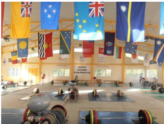
The Institute set up, ready for action for the Pacific Games.

On the 14 th of July, all equipment for training for the Pacific Games was in place. Coinciding with Bastille Day, a small function was held at the Institute. We had the pleasure of the company of quite a few top officials from CTOS, Pacific Games Council, City of Mont Dore and the New Caledonia Government.