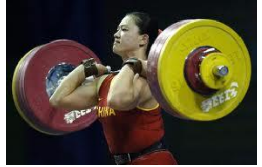
Cao Lei – World and Olympic Champion

and CAO Lei the Olympic Champion 2004- 2008 in the 69Kg category. This visit of the Chinese team will be a great privilege for the Institute athletes to train alongside some of the best weightlifters in the world. And it will be a big boost to the Pacific lifters in preparation to the World Championships to be held in Paris in the month of November.