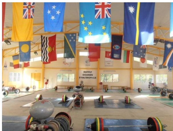
The Oceania Institute ready for training