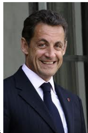
Nicolas Sarkozy, President of the French Republic

New Caledonia is ready to welcome the Pacific. The sports facilities are world standard and the athletes can look forward to a great two weeks of competition. Thank you New Caledonia for what will be a magnificent sporting extravaganza.