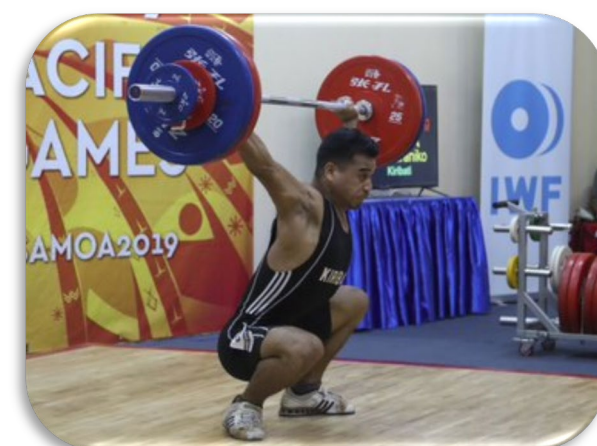
TARETITA TABAROUA- KIRIBATI 1 GOLD