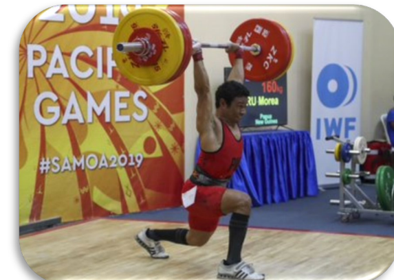
MOREA BARU – PAPUA NEW GUINEA, GOLD GOLD GOLD