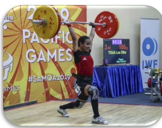
DIKA TOUA - PAPUA NEW GUINEA, GOLD GOLD GOLD