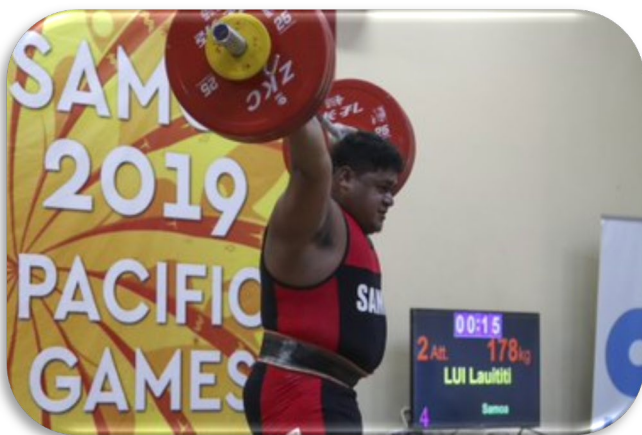
LAUITTI LUI - SAMOA 1 GOLD