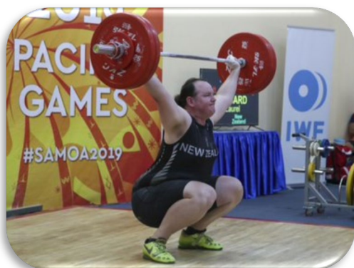
LAUREL HUBBARD -NZL 2 GOLD