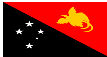
Papua New Guinea